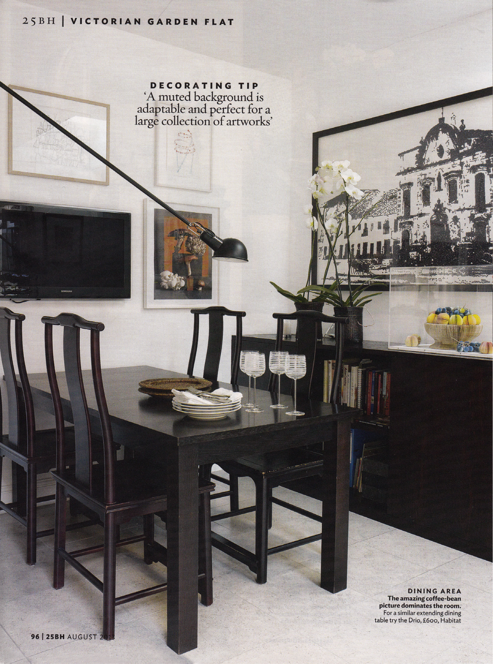
DINING AREA The amazing coffee-bean picture dominates the room. For a similar extending dining table try the Drio, £600, Habitat

DECORATING TIP 'A muted background is adaptable and perfect for a large collection of artworks'