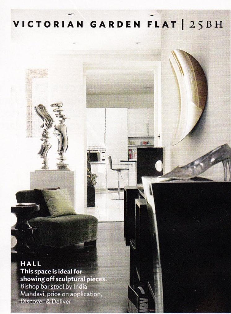
HALL This space is ideal for showing off sculptural pieces. Bishop bar stool by India Mahdavi, price on application, Discover & Deliver