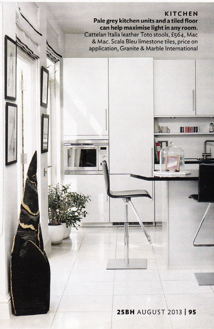
KITCHEN Pale grey kitchen units and a tiled floor can help maximise light in any room. Cattelan Italia leather Toto stools, £564, Mac & Mac. Scala Bleu limestone tiles, price on application, Granite & Marble International

4 SITTING ROOM The grey chimney breast is one of the few concessions to colour on the walls. A 3D artwork by Tadashi Kawamata adds impact. René coffee table, from £1,600, Casa Milano, from Chaplins. Chimney breast, painted in Manor House Gray estate emulsion, £34.50 for 2.5 litres, Farrow & Ball