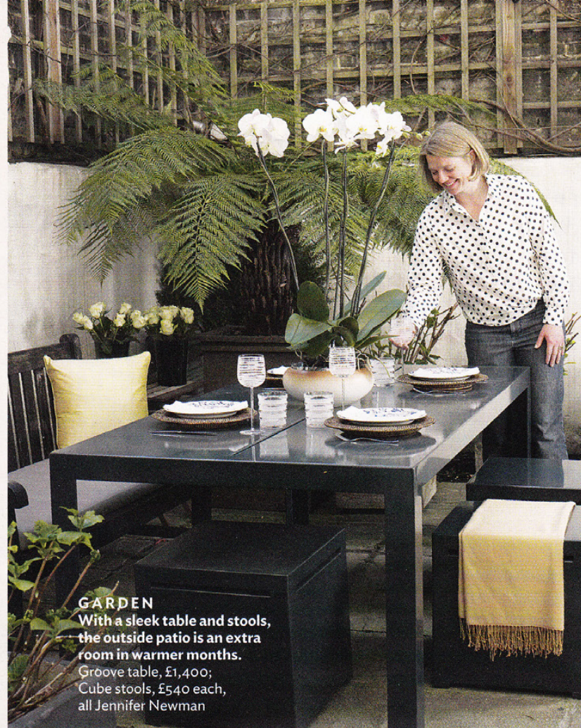
GARDEN With a sleek table and stools, the outside patio is an extra room in warmer months. Groove table, £1,400; Cube stools, £540 each, all Jennifer Newman

THE PROPERTY Garden flat in a stucco-fronted Victorian house LOCATION London ROOMS Hall, sitting room/study, kitchen-diner, two bedrooms (one en suite), bathroom PURCHASED 1996 PREVIOUS PROPERTY 'I lived in a two-bedroom rented flat nearby,' says Melanie.